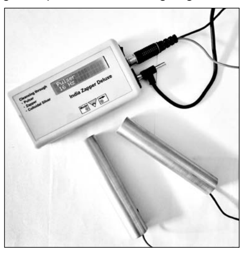
India Zapper Deluxe (including pulsar and colloidal silver maker)

Just like zapper, the purpose of a pulser is to help eliminate harmful parasites, allowing the body to heal on its own. Elimination of parasites is an excellent way to boost the immune system and promote good health quickly and safely.