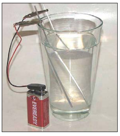
Colloidal silver maker

Concentrations of colloidal silver, at five parts per million (ppm) or higher, have been found to kill numerous infectious bacteria. One