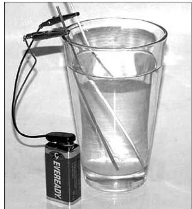
Colloidal silver maker

Concentrations of colloidal silver, at five parts per million (ppm) or higher, have been found to kill numerous infectious bacteria. One ppm is equivalent to one milligram of solid per litre of liquid (mg/l). Before 1938, colloidal silver was widely used by physicians as a mainstream antibiotic, but the material was costly and the pharmaceutical industry developed fast acting and less expensive sulpha drugs, and penicillin.