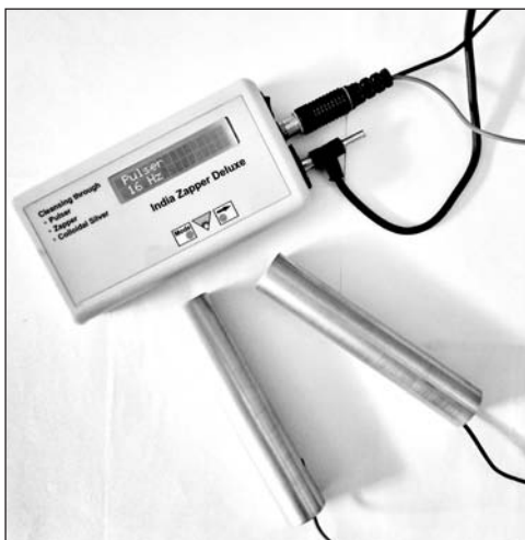
India Zapper Deluxe (including pulser and colloidal silver maker)

Just like zapper, the purpose of a pulser is to help eliminate harmful parasites, allowing the body to heal on its own. Elimination of parasites is an excellent way to boost the immune system and promote good health quickly and safely.