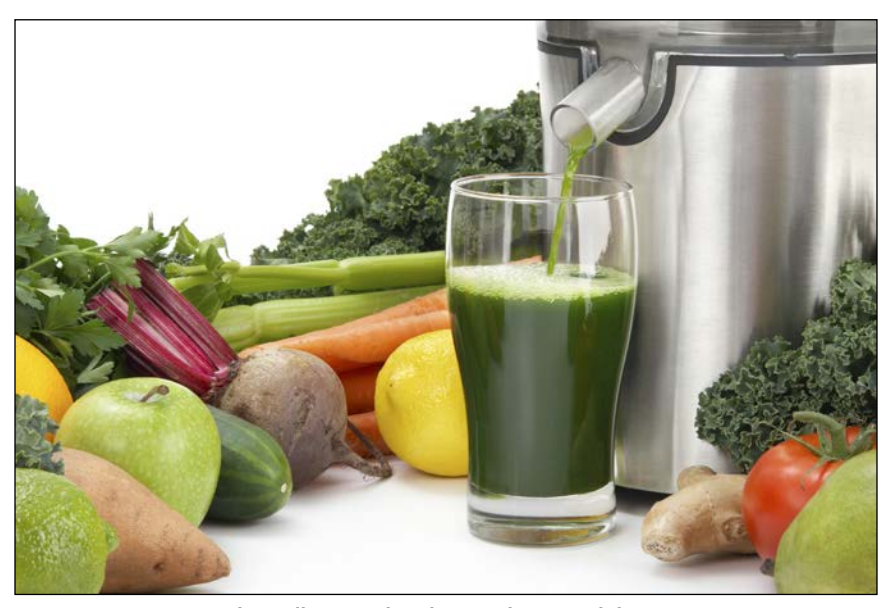
Ingredients and tools to make green juices

Witness the miraculous cure, for all your problems, unfold within a week. Many of my friends have replaced their morning tea with a glass of green vegetable juice. Drinking this fresh green juice overnight fights stomach acidity and provides a great start to the day.