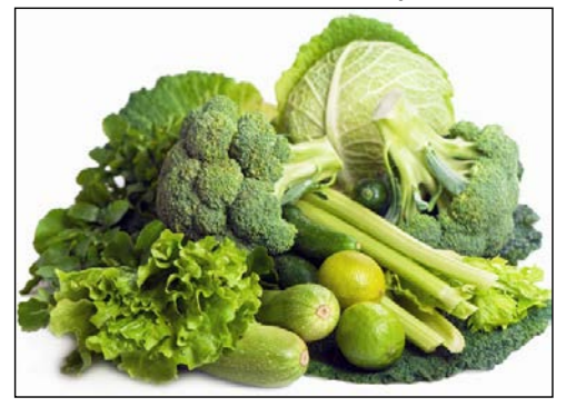
Blood tonic - chlorophyll

of rich and easily absorbable nutrients. Fresh vegetable juices contain proteins, carbohydrates, chlorophyll, mineral electrolytes and healing aromatic oils. Most importantly, a fresh juice makes large amounts of plant enzymes available to every cell in our body, an